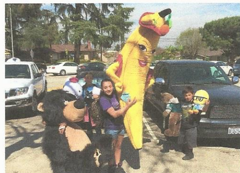
Below: Students from Palm Elementary help offload toys hoping they will be a TOP BANANA!

Our next big project we are seeking help with is the collection of school supplies and packing backpacks for the new school year, which begins August 7th.