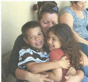
Why we do what we do is shown in this picture!

Yes New Horizons I can help. Here is my tax deductible donation to help low-income children and single parent families right away. I am enclosing my check for: